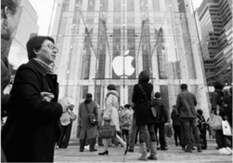
New York's Fifth Avenue store