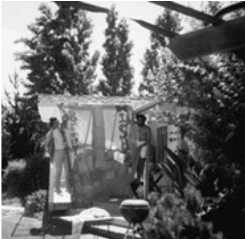
With the "SWAB JOB" school prank sign