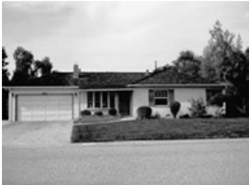
The Los Altos house with the garage where Apple was born